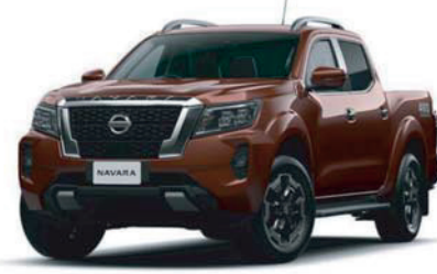
Forged Copper (MT Only)