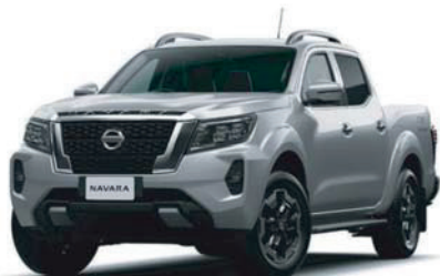
Brilliant Silver (MT Only)