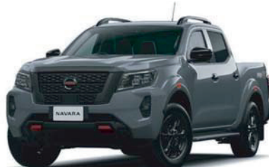
Stealth Pearl Gray