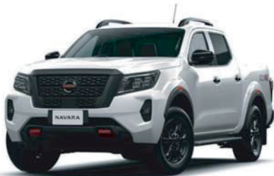
Aspen Pearl White